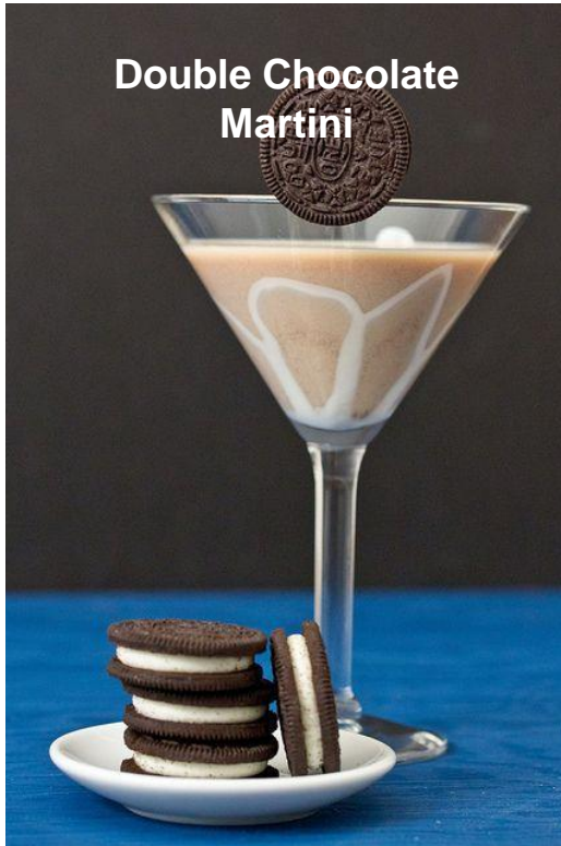
Double Chocolate Martini

Seeing Double? Yes, please! Food. Drinks. Indulge.