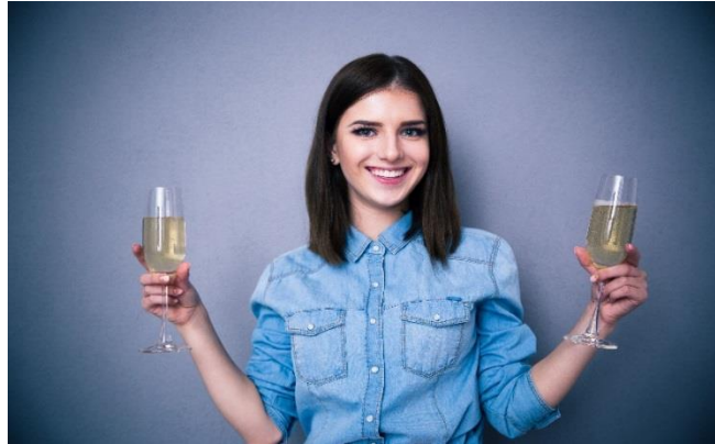
Double-Fisting Ice Cream Cones For The Kids OR Champagne For The Adults