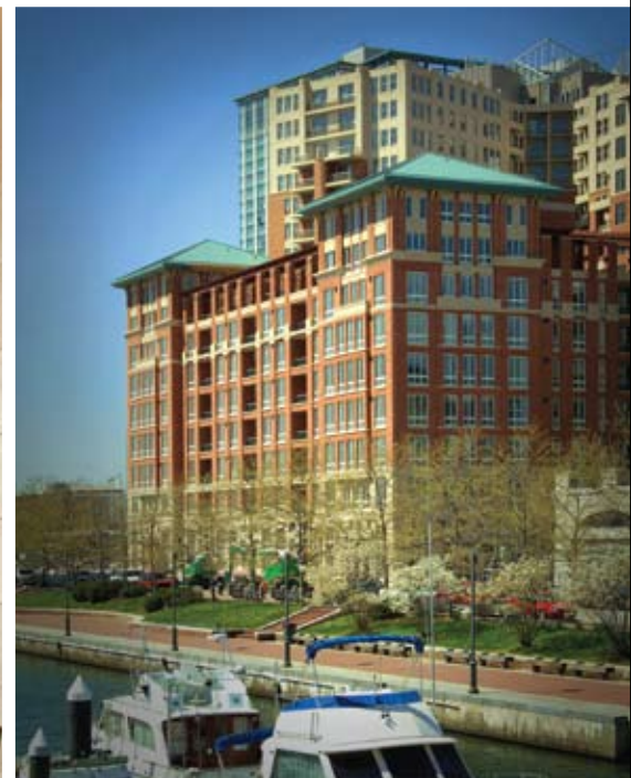
Above and left, Spinnaker Bay, Baltimore, MD. Opposite page, Summerfield at Brambleton, Ashburn, VA; Kitchen at Shipley's Grant, Ellicott City, MD.