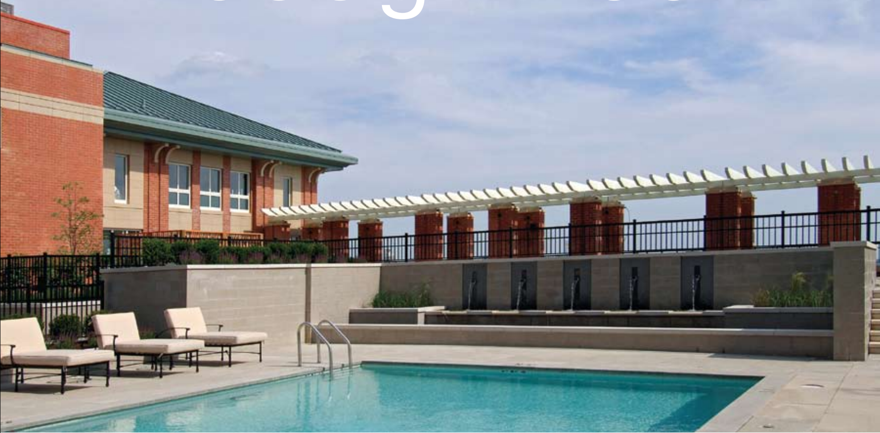
Rooftop pool at Spinnaker Bay in Baltimore, MD, one of our most award-winning communities.